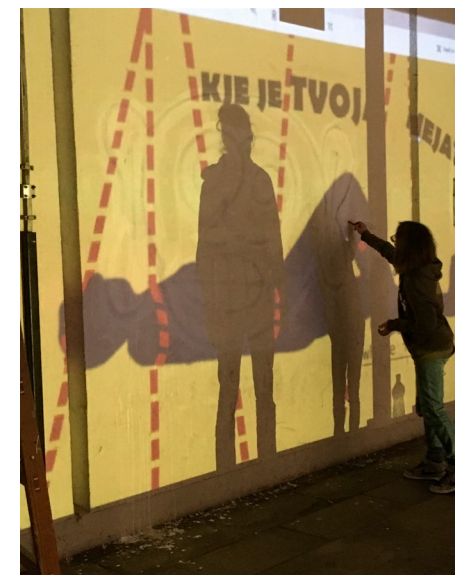
Students from Budapest, Cracow, Belgrade, Rijeka and Nova Gorica were Mapping the Borders , their own but also the local border between Slovenia and Italy in the twin towns of Nova Gorica and Goric.