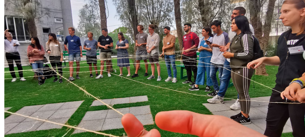
Introductory session at the EMindS workshop on Cyprus, where students of Nova Gorica joined forces with colleagues of other courses from the Graz, Helsinki, Solun and Nicosia.

As students progress along their studies, the three-year bachelor's programme in Digital Arts and Practices and the two-year master's programme in Media Arts and Practices, they navigate the realms and carrier modules of animation, photography, (video)film, new media, scenographic spaces and contemporary art practices; in the master's programme they can also take courses at partner universities abroad.