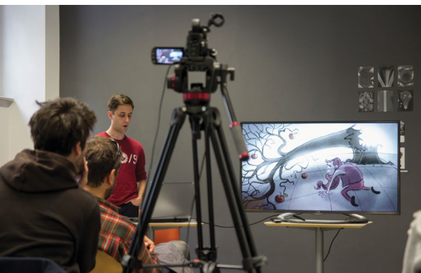
Student present or pitch their diploma and MA graduation projects in different production stages for colleagues and mentors.

We value the student as an independent and creative personality who develops in the group, within a community. With innovative approaches in pedagogic, research and production processes, we encourage independent creative and academic work supervised by an open group of experts. Mentors and guests are carefully chosen based on their excellence in contemporary practice as well as academic credentials, which ensures that the knowledge and skills we share with students are relevant and of a high quality. To learn more about the teachers, visit the web page //au.ung.si/en/educating/people . Project-based work and production